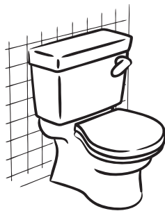
after using the bathroom